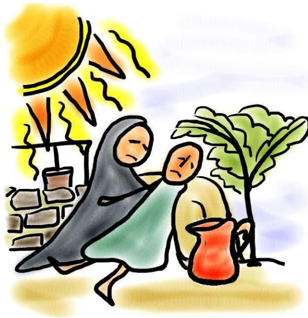
Hagar, (Haajar) and Ishmael

Markaasaa Ilaah indhaheedii furay, oo waxay aragtay ceel biyo ah; kolkaasay tagtay, oo sibraarkii biyo ka soo buuxisay, oo wiilkii waraabisay.