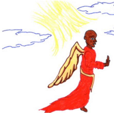
the angel Gabriel (Jibril)

Who is this girl? Her name is Mary ( Maryam ). She was a good girl. She was from a good family. She was promised to marry a man named Joseph from her village of Nazareth.